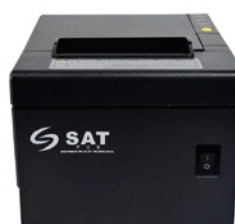
POS printer SAT 38T