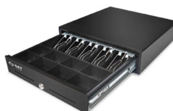
Coin drawer SAT 119Z