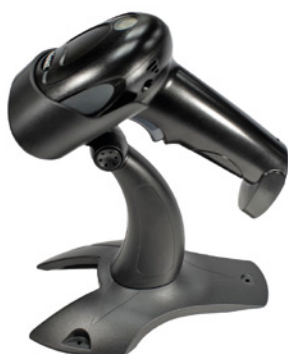
SAT AI402 ID OCR