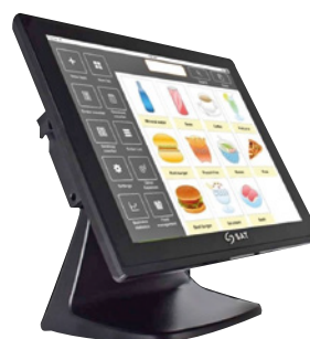
AIO POS CI150