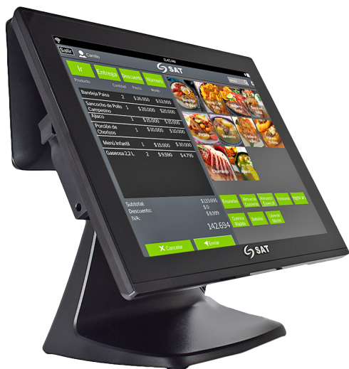
ALL IN ONE SAT CI150