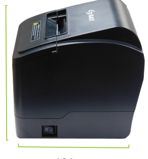
184 mm 7.3in