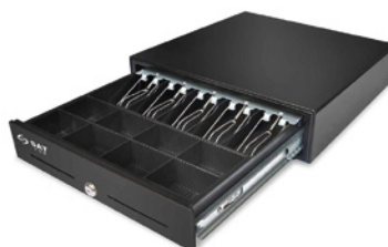
Cash drawer SAT 119Z