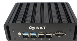
Mini PC: SAT PL5000C