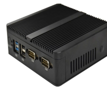
Mini PC: SAT Z4125